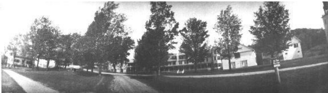
A "bird's eye" view of the Washington Center of yesteryear

The Schoolhouse was open on Saturday from 1-3 during the months of July and August. There were 55 who signed the guest book, though several others visited without signing. The building was opened several times by request. It is rare to see a 150-year-old antiquity in such pristine condition. For those of you who have not visited this historic place, please plan to do so next year.