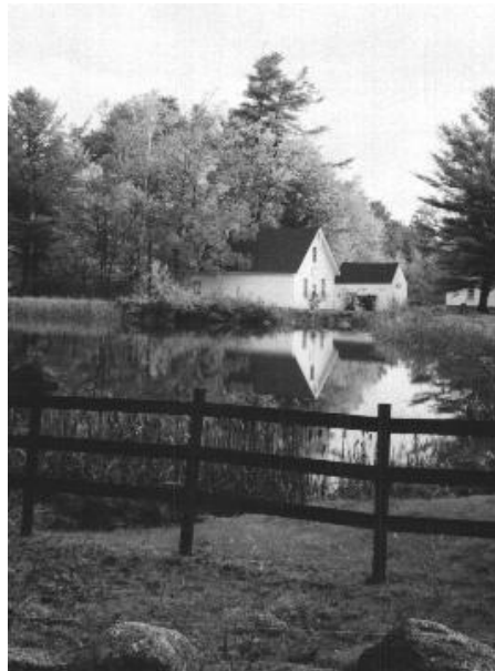
District #5 School and Pond

In 1999, the East Washington Schoolhouse celebrated its 150th year. It was constructed in 1849. In 1851, the State Board of Education called it a model schoolhouse. It has seen a few, but not many modifications through the years. One of the changes this year was roll-up shades