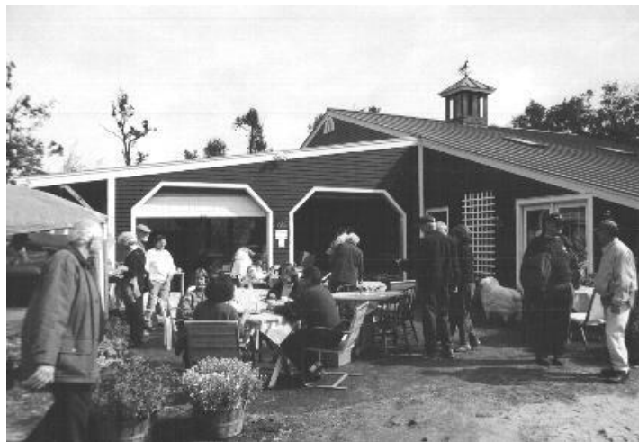
Sidewalk Café: at the Rhoades' Farm during Wool Days

The Society's participation in the 4th of July Flea Market, Old Home Days weekend, and our ``Sidewalk Café: at the Rhoades' Farm during Wool Days'' were well rewarded with much needed revenue to support the Society's objectives.