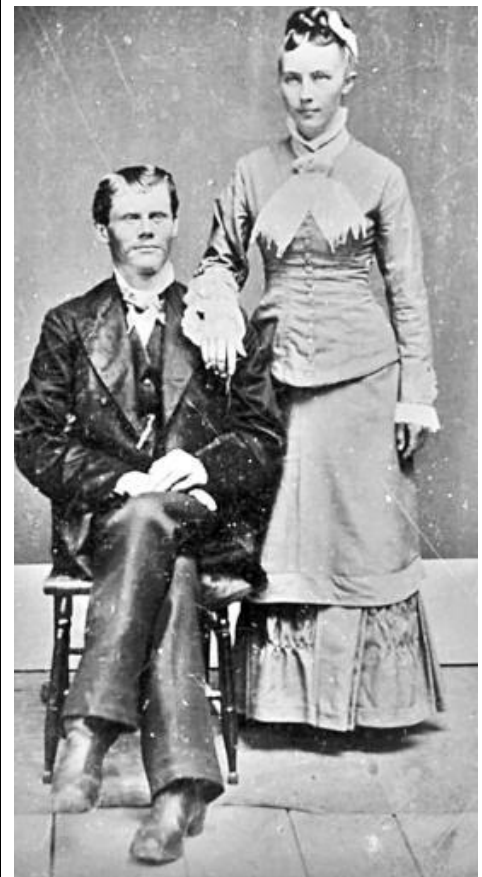
After computer enhancement