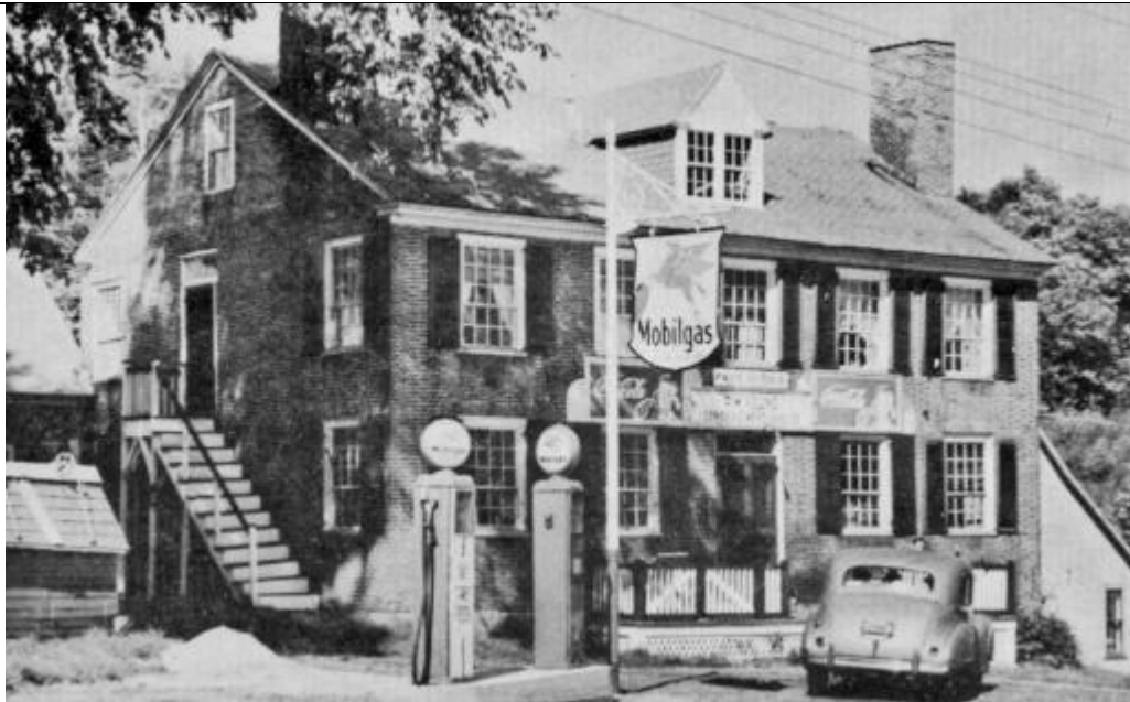
The brick house (built in 1820) in the center of town when it served as a store, gasoline station and post office, in the early 1920's. From the Museum's postcard collection.