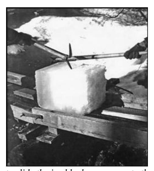
It would take two men to slide the ice block up a ramp to the icehouse for storage.

Perley Crane and family used to cut ice on the pond and used it to keep milk cold at the farm during the warmer weather and hot summer days.