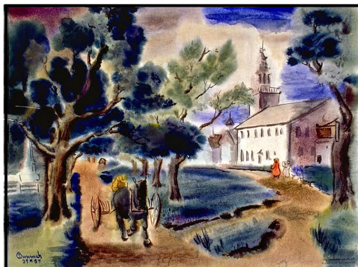
Sunday Morning – 1939.

When you visit the exhibit this summer, you'll see these changes happening "before your eyes" by comparing two particular paintings. In "Sunday Morning," from 1938, you'll see life as it had been